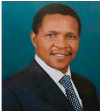
President Jakaya Kikwete

The most important change that has manifested itself from perhaps a decade ago is that African countries have tried to become far less reliant on international aid than before, moving steadfastly towards self-reliance, with transparent, just leadership guiding countries into their full potentials. It has been witnessed in South Africa since the fall of Apartheid, it can be seen in Nigeria in the campaign against corruption, and it is evident in emerging East African markets attracting investor confidence from Asian, European, and US interests. More significantly, to gain a wider understanding of which policies are most effective, a new generation of African leaders is sharing insights and experiences, advancing the impact of development communities (SADC) and economic co-operations (EAC and COMESA), and striving to alleviate poverty across the continent.