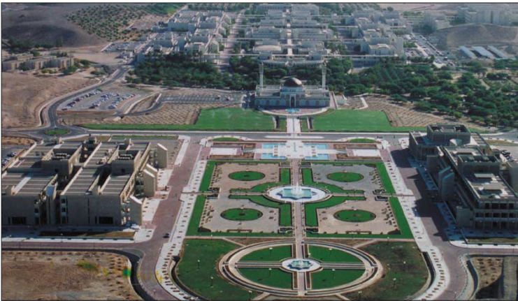
Sultan Qaboos University

When Qaboos bin Said became Oman's new Sultan in 1970, there were only three schools in the country. No more than 909 pupils were being taught by 30 teachers. This fact had frustrated many young Omanis, who consequently sought their education abroad, particularly in neighboring Gulf States, Iraq, and Egypt. Knowing the needs of his people first hand and realizing that the key to creating a modern, flourishing Oman was education, the Sultan set about prioritizing the development of the country's academic system. Even when infrastructure was absent and resources not immediately available, Sultan Qaboos showed that where there is a will, there is a way, and set up impromptu tents as makeshift schools.